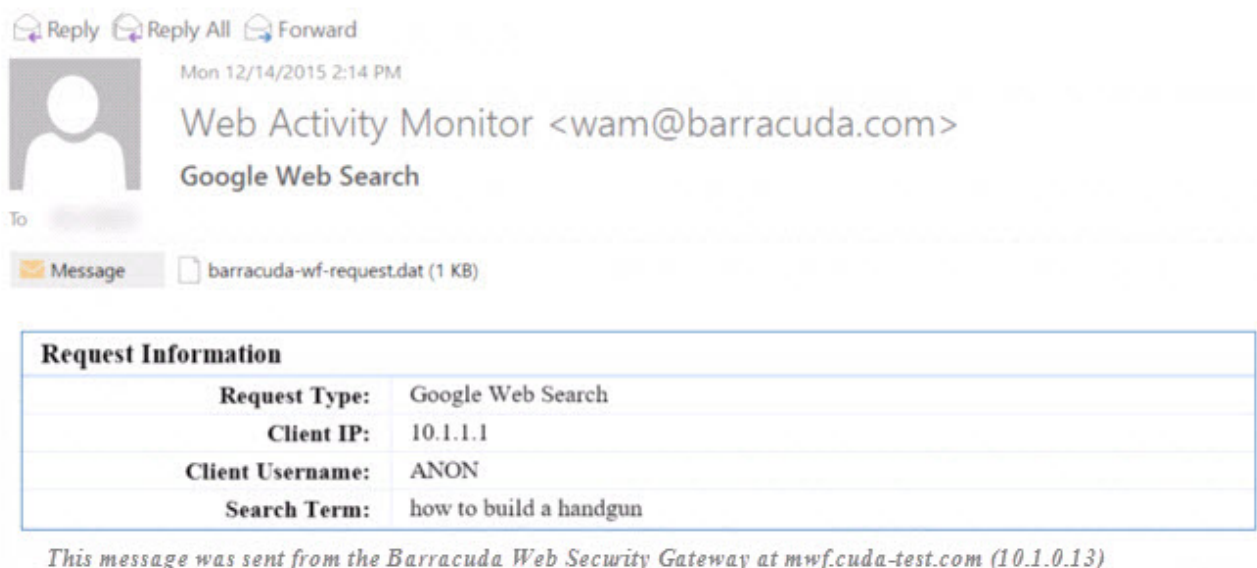
Figure 1: Example alert message to the administrator