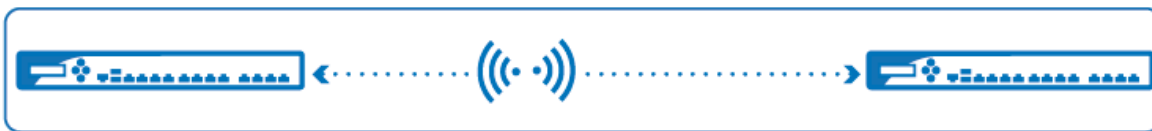
F-Series Firewall High Availability Cluster

Additional considerations have to be made when updating a Barracuda NextGen Firewall F-Series or NextGen Control Center in a high availability cluster.