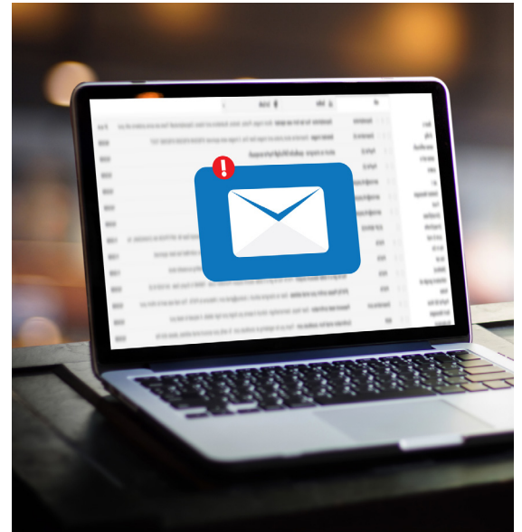
PhishLine's simulated email phishing campaigns teach security awareness concepts through real-life learning experiences.

Talk to your consultant and start changing your employee culture with your next campaign.