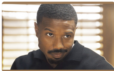
'Protect Connect,' one of four new live-actor training videos available now in the Content Center

Fresh, funny and filled with cameos from actors such as Michael B. Jordan, these highly produced vignettes take information security training to A-List levels—all in the time it takes to watch a Hollywood trailer!