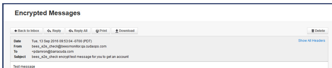
Figure 2. Viewing an Encrypted Message

Click on a message to view the contents of a message, as shown in Figure 2. You are the only one who can read the message body. You can view the message headers by clicking the Show All Headers link in the upper right. From the message window you can use buttons on the message bar: Reply to, Reply All, Print, Delete or Download the message. Attachments can be downloaded individually by clicking on them.