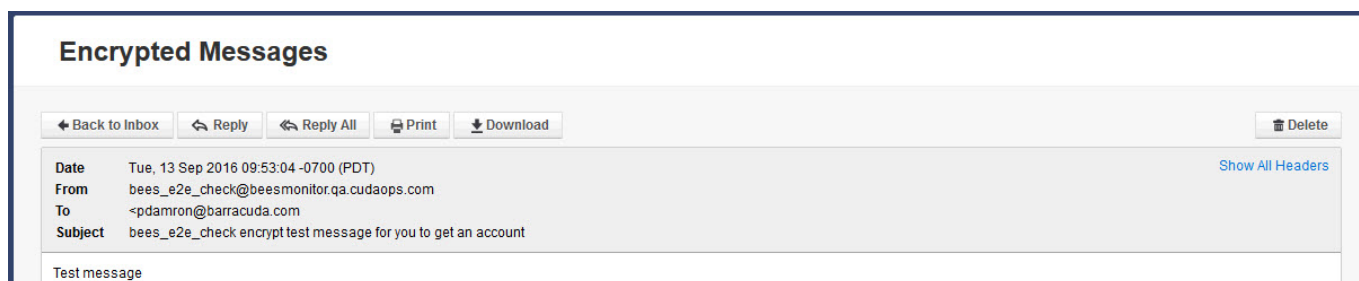
Figure 2. Viewing an Encrypted Message

Click on a message to view the contents of a message, as shown in Figure 2. You are the only one who can read the message body. You can view the message headers by clicking the Show All Headers link in the upper right. From the message window you can use buttons on the message bar Reply to, Reply All, Print, Delete or Download the message. Attachments can be downloaded individually by clicking on them.